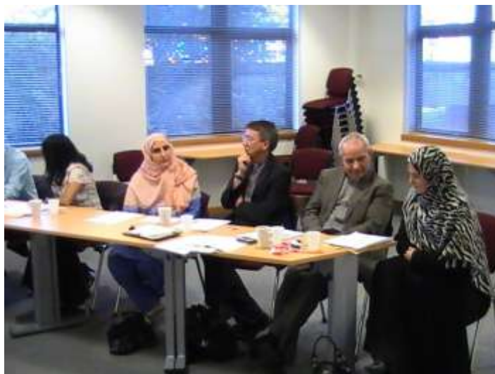
Discussing SACRE matters

A meeting was then arranged with the County Council Web team to investigate the possibility of setting up a website for the SACRE. This was approved and the website is now up and running ( www.northamptonshire.gov.uk - Education and Learning, Information for Schools). Obviously work will be ongoing to keep the website up to date. The SACRE hope that schools will find this website useful and welcome comments on how it can be developed to be of further help in providing support and guidance to schools in Religious Education and Collective Worship.