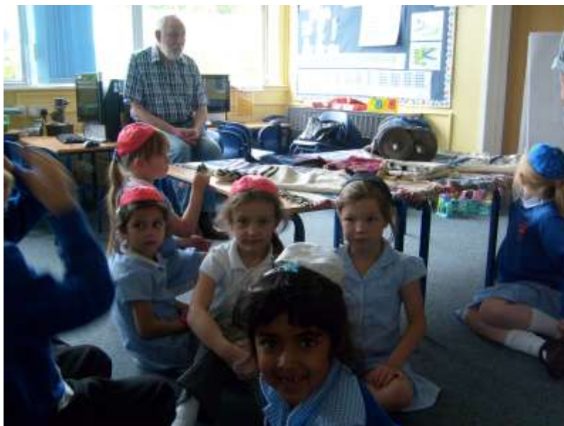
Planning for visitors from the Faith Communities to come into school

The Agreed Syllabus emphasises standards of attainment expected at the end of each Key Stage and includes guidance on planning and assessment.