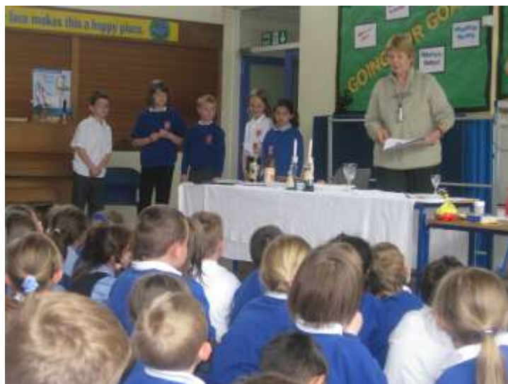
Collective Worship in a Primary School