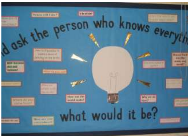
A Thought Provoking School Display