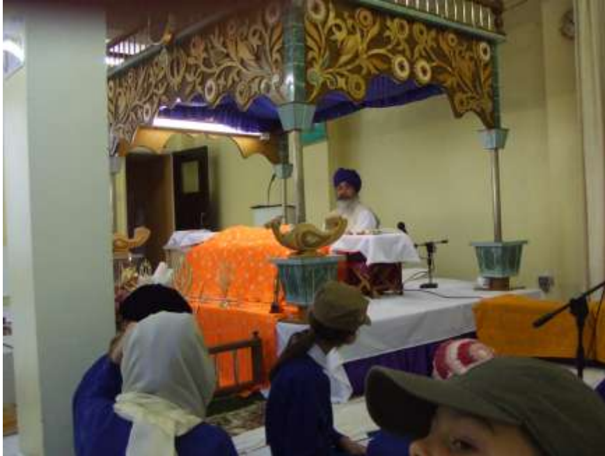
Linking with Faith Communities through visits

that this guidance will be produced during 2009 – 2010 and will then be made available to schools. A Working Party has been set up and will be meeting regularly.