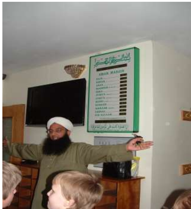
A school visit to a Mosque brings learning alive

Requests from Primary colleagues have been for future Network Groups to focus on specific religions in order to develop teacher knowledge, understanding and confidence and SACRE will be pleased to support such sessions over the coming year. The first will focus on Islam and will be supported by Muslim colleagues from The Race Equality Team.