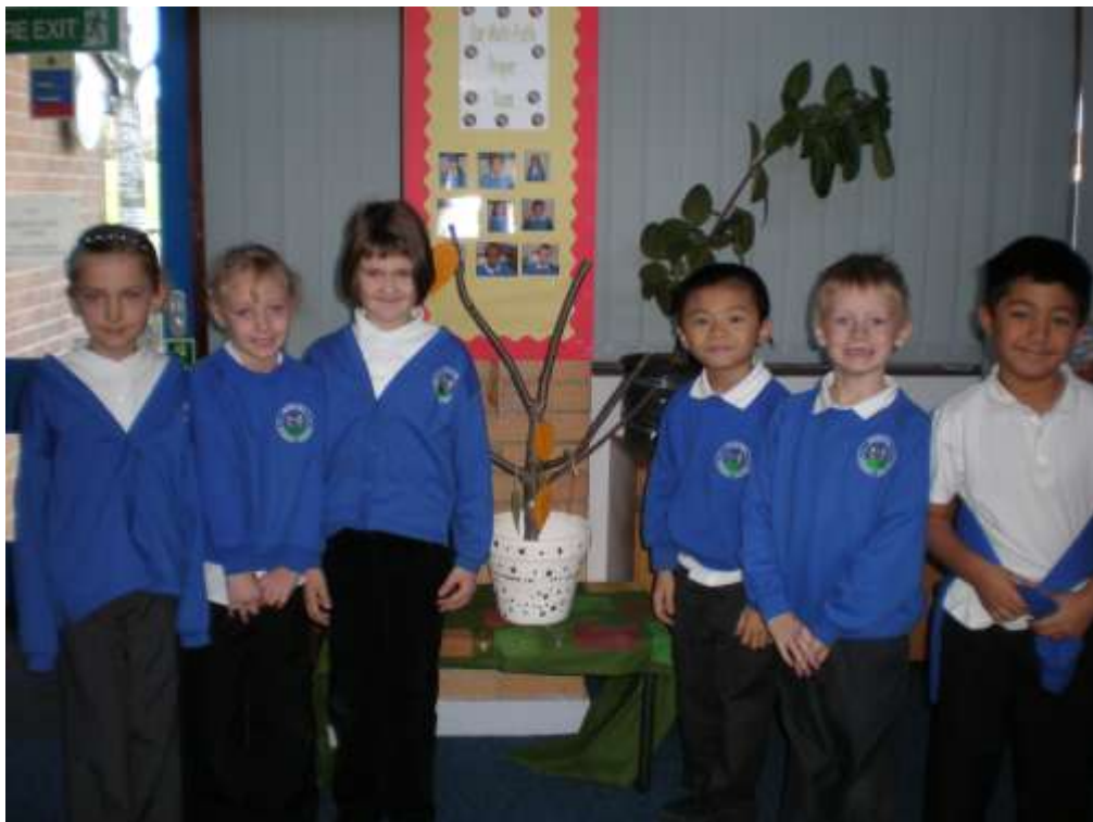
Opening a Multi-Faith Prayer Room

This session identified ways in which schools can promote spiritual development through the curriculum but also in many other ways as well. Participants took part in a range of activities to experience the “wow” and “ouch” factors for themselves. Several schools have since reported the positive effects of providing greater opportunities for spiritual development upon the behaviour and well being of pupils and staff alike. This is pleasing for the SACRE to note.