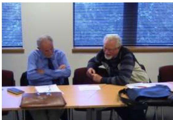
Engaging in discussions

Members also participate in a range of activities as a way of being kept informed of high quality learning experiences. These activities are led by the Learning Adviser or by county teachers. The main focus for this year's activities has been, "Promoting Spiritual Development", following requests from members of the SACRE.