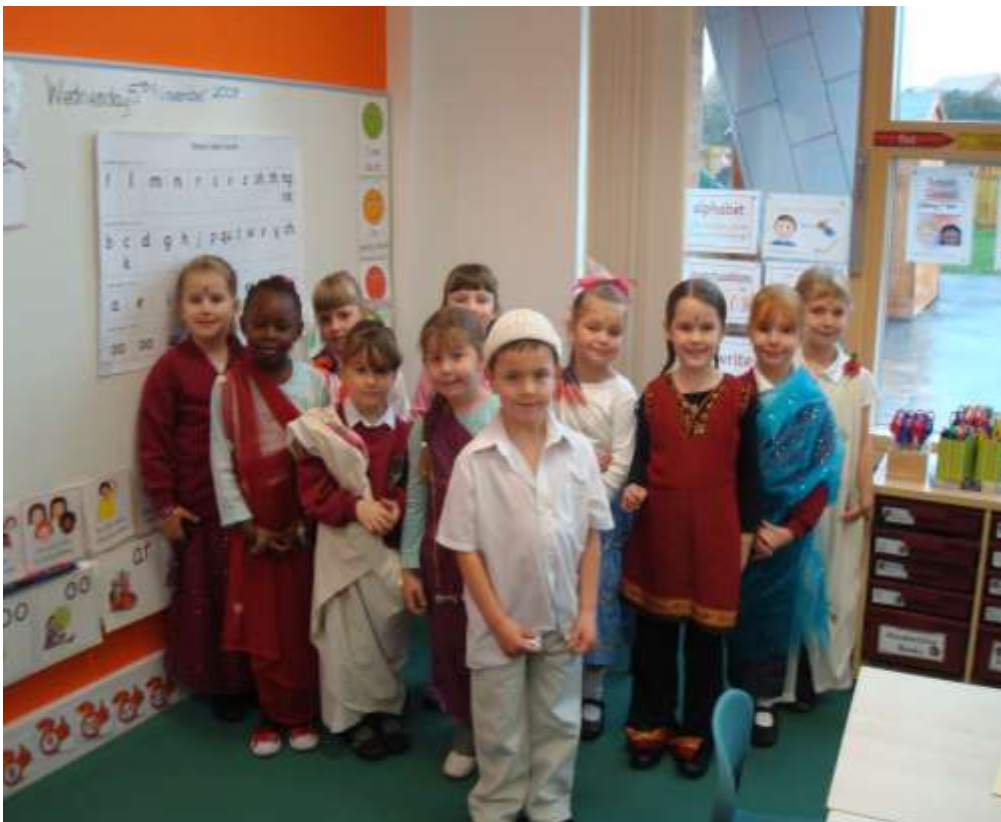
Local Schoolchildren Enjoy Diwali Celebrations!