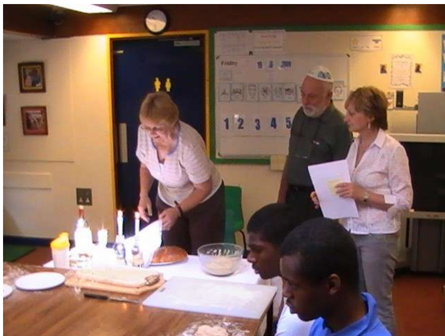
Members of Local Faith Communities share experiences with local schools

On pages 9-11 of this report, there is a summary of advice given by the SACRE to the Local Authority. Governing Bodies in schools are urged to pay close attention to the report and act upon the advice given.